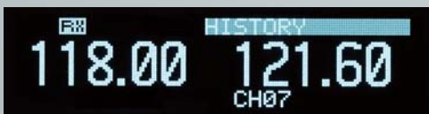
Operating information is clearly shown on the OLED display.

A fixed mount VHF airband first! The IC-A210 has an organic light emitting diode (OLED) display. The OLED display emits light by itself and the display offers many advantages in brightness, vividness, high contrast, wide viewing angle and response time compared to a conventional display. In addition, the auto dimmer function adjusts the display for optimum brightness at day or night.