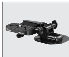
MB-65 MOUNT BASE Mounts the remote control head with the MB-58. Angle and direction is adjustable.