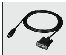
OPC-1384 DATA CABLE Transceiver to PC/GPS receiver, 8-Pin DIN to RS-232C cable.