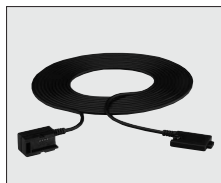
OPC-600/R, OPC-601/R SEPARATION CABLES OPC-600/R: 3.5m (11.5ft); OPC-601/R: 7.0m (23.0ft)