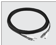
OPC-441 SPEAKER EXTENSION CABLE 5.0m (16.4ft)