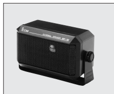
SP-10 EXTERNAL SPEAKER