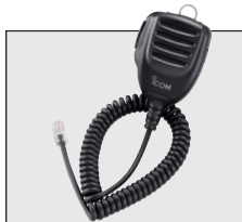
HM-154 HAND MICROPHONE Regular hand microphone.