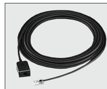
OPC-440 MIC EXTENSION CABLE 5.0m (16.4ft)