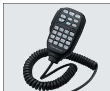
HM-133 REMOTE CONTROL MICROPHONE Remote control microphone with keypad backlighting.