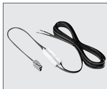
OPC-1132A, OPC-347 DC POWER CABLES OPC-1132A: 3.0m (9.8ft); OPC-347: 7.0m (23ft)