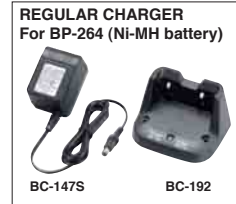
REGULAR CHARGER For BP-264 (NI-MH battery)

*Tx: Rx: standby = 5:5:90. Power save function ON.