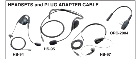
HEADSETS and PLUG ADAPTER CABLE