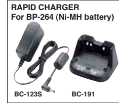
RAPID CHARGER For BP-264 (NI-MH battery)