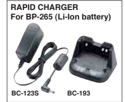
RAPID CHARGER For BP-265 (LI-Ion battery)